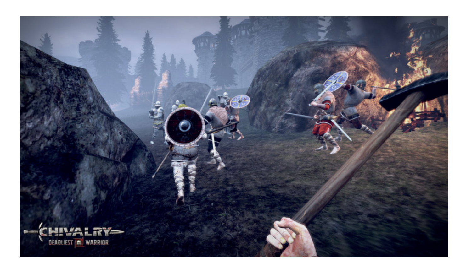
Chivalry: Deadliest Warrior Download Setup Exe